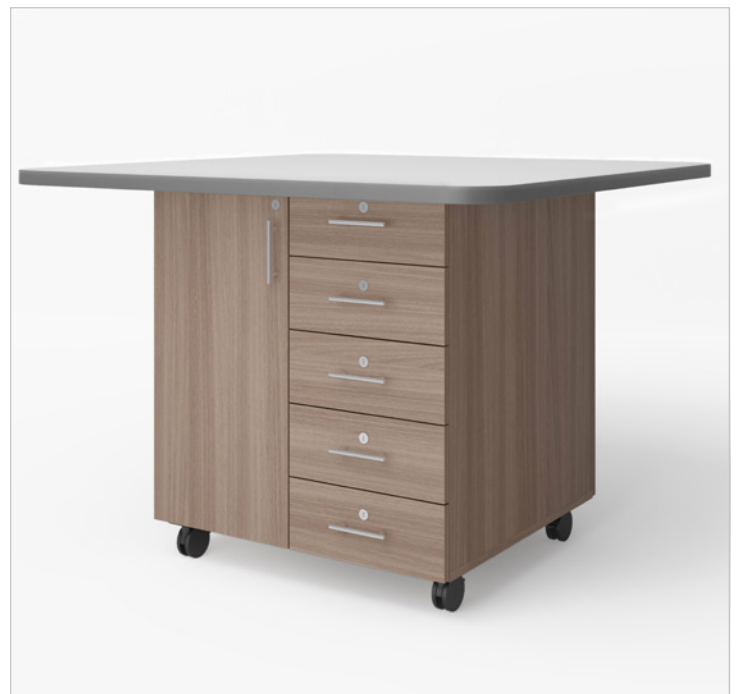
Mobile Science Station with 54" Square Top Lockable Single Door and Five Drawers Shown in Bleached Legno Finish