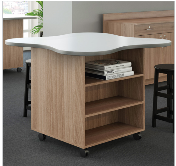
Mobile Science Station with 48" Clover Top Two Adjustable Shelves per Side

Laminate Finishes: Available in standard Wilsonart or Formica colors for project orders.