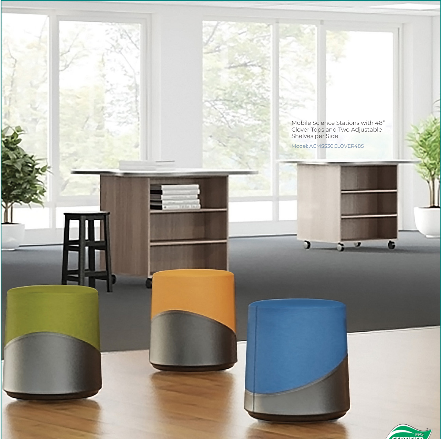
Mobile Science Stations with 48" Clover Tops and Two Adjustable Shelves per Side Model: ACMSS30CLOVER48S

Modular solutions with built-in mobility to grow with you. Allied Caseworks offers the most creative and flexible options for utilizing every inch of space.