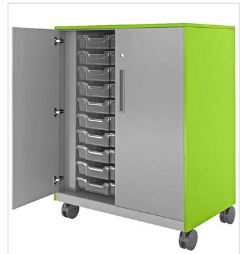
45" Model With Totes & Doors