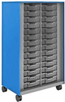
60" Model With Totes Model: MMS60T