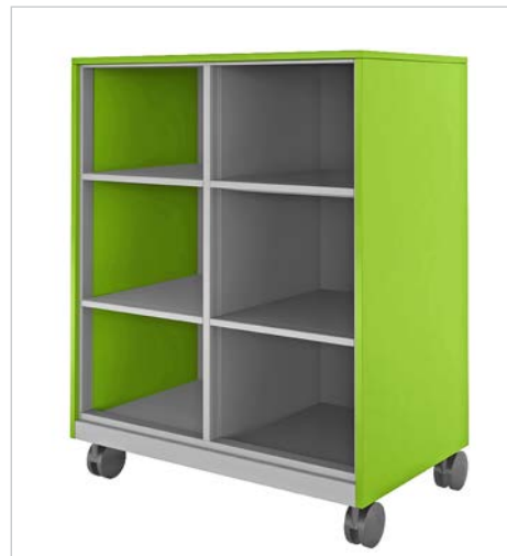
45" Model With Cubbies