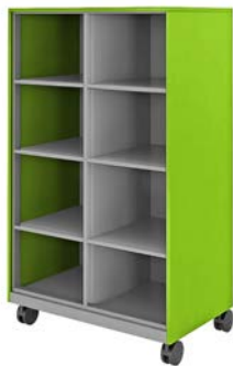
60" Model With Cubbies Model: MMS60C