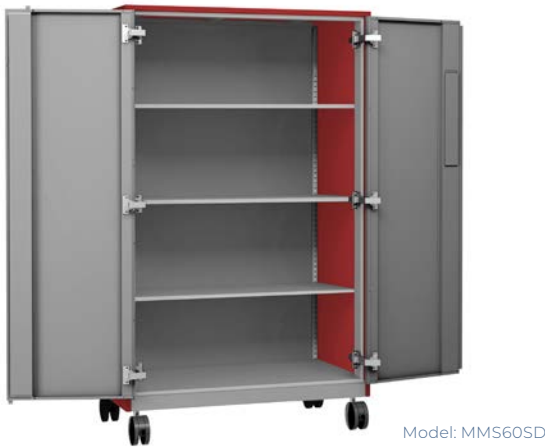
60" Model With Shelves and Doors