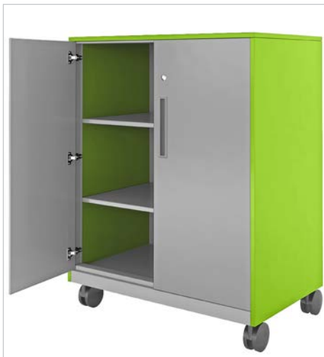
45" Model With Shelves & Doors