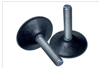
Adjustable Leveling Glides