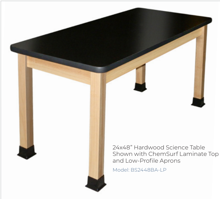
24x48" Hardwood Science Table Shown with ChemSurf Laminate Top and Low-Profile Aprons Model: BS2448BA-LP

Back Pack Hook: 11 gauge top plate connected to ¼" diameter wire hook. Fully chrome plated. (Order HOOK)