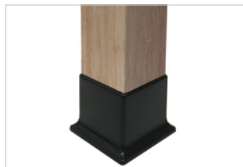
2¼" Solid Hardwood Legs