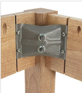
Premium Twin-Bolt Fastening System