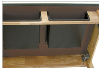
Double Book Boxes