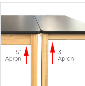
Optional Low-Profile Aprons (Order LP)