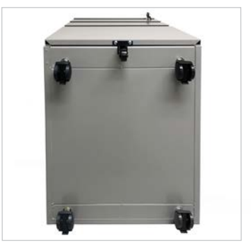
4 Smooth Rolling Casters for Mobility. 5th Stability Wheel Prevents Tipping.