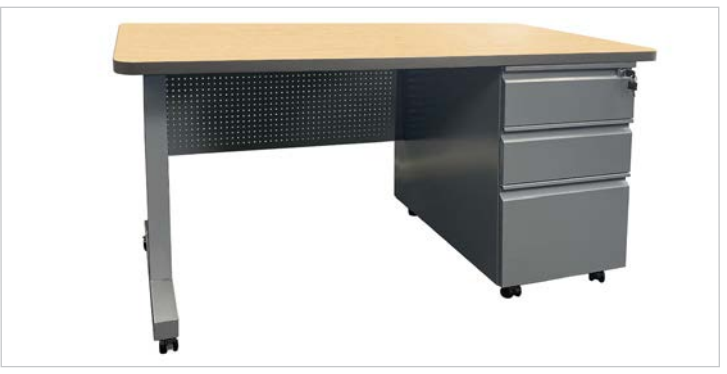
Single Pedestal Desk