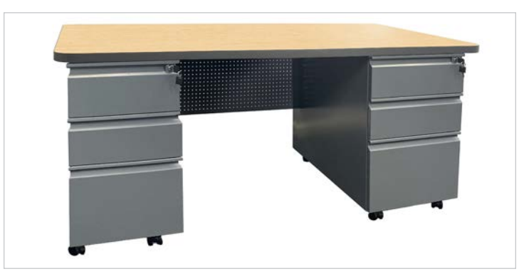
Dual Pedestal Desk