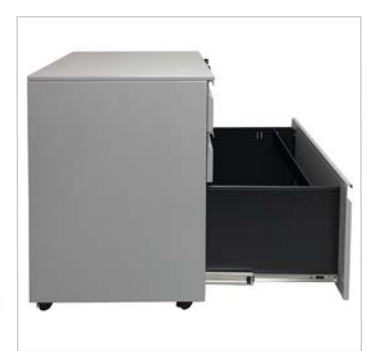
Full-Suspension Glides. Letter or Legal Size Hanging File Drawer