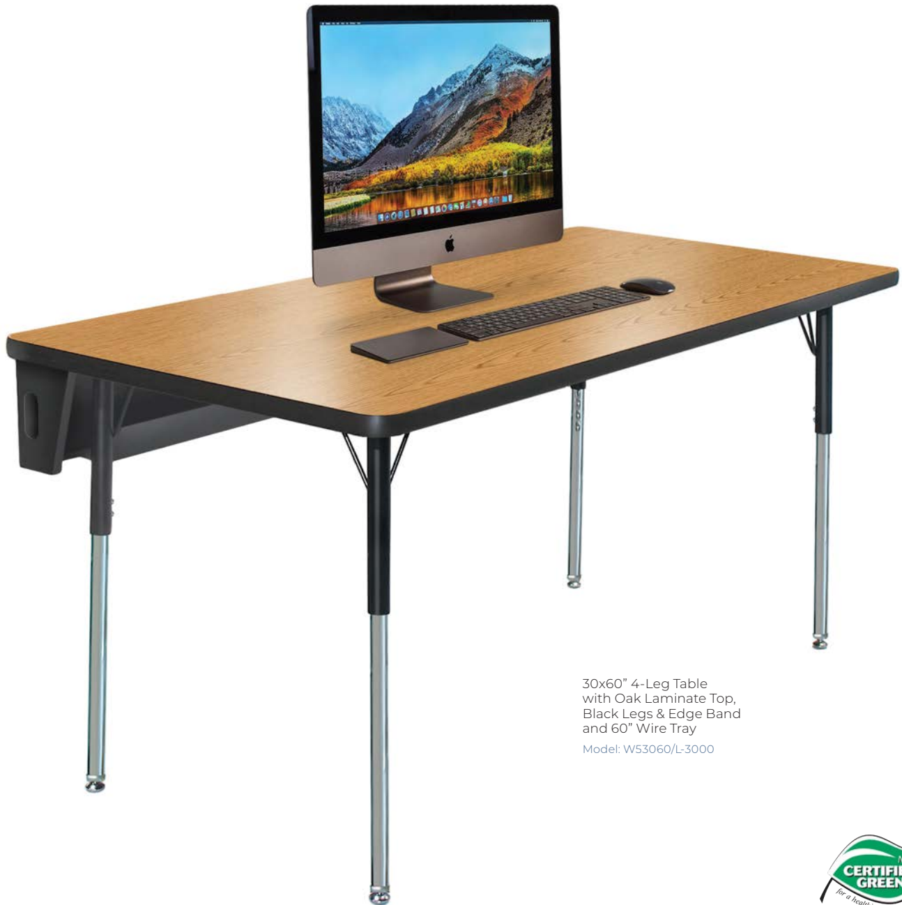
30x60" 4-Leg Table with Oak Laminate Top, Black Legs & Edge Band and 60" Wire Tray Model: W53060/L-3000