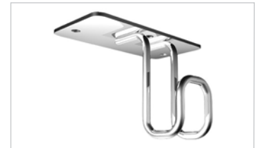
Back Pack Hook