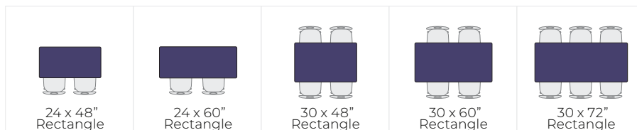
Table Top Shapes