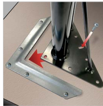
Precision Leg Fastening System