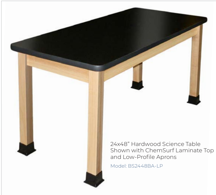
24x48" Hardwood Science Table Shown with ChemSurf Laminate Top and Low-Profile Aprons Model: BS2448BA-LP