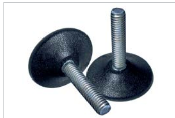
Adjustable Leveling Glides