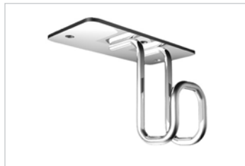
Back Pack Hook