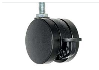
2 1/2" Swivel Casters