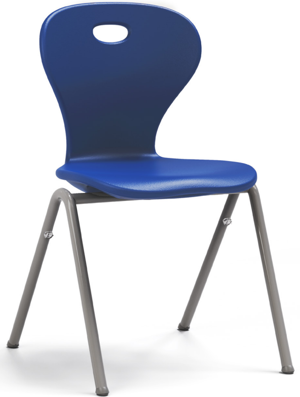
Oracle 18"H Chair shown in Midnight Blue